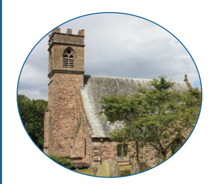
Church of St Michael and All Angels