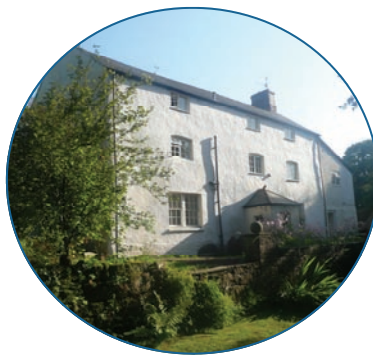
Church Farm Guesthouse