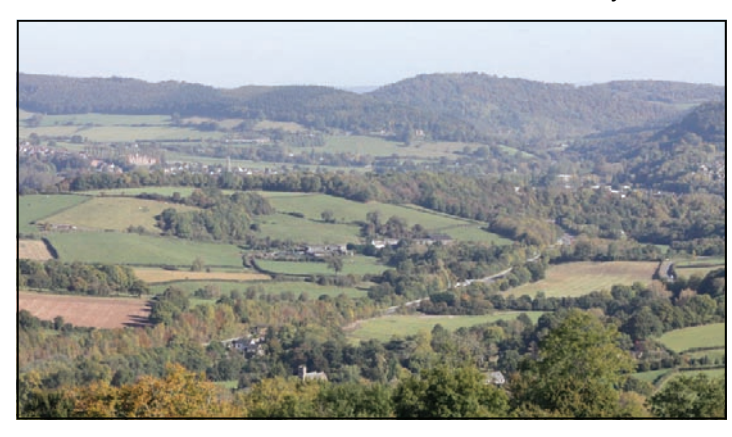
View of Monmouth with St Michaels Church, Mitchel Troy

Continue down a third field to a stile with two waymarks